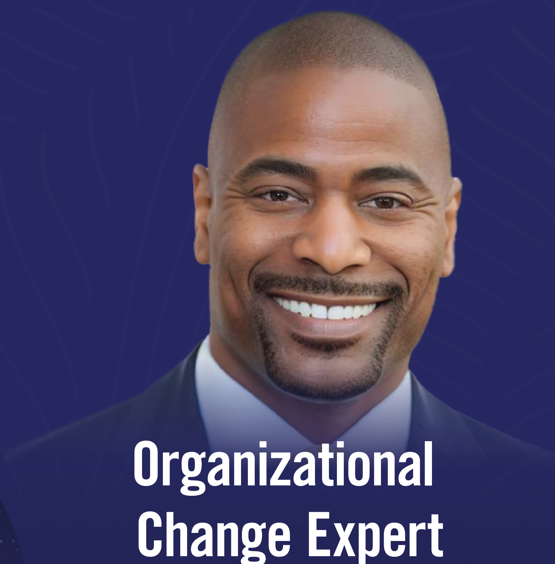
Organizational Change Expert