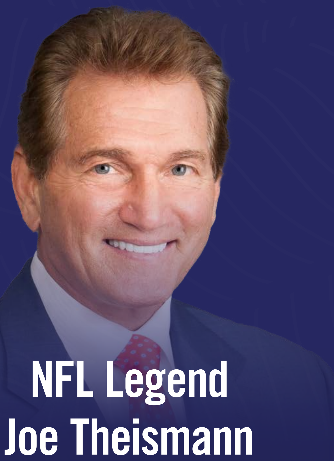
NFL Legend Joe Theismann