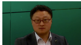
Keynote Fireside Chat: LOTTE Insurance