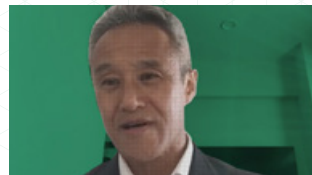
Keynote Fireside Chat: Government Pension Investment Fund (GPIF)