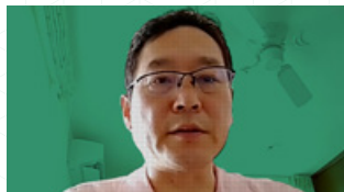
Keynote Presentation: Japan Post Bank