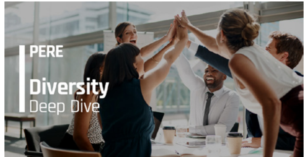
8 September Driving parity and inclusion in private real estate