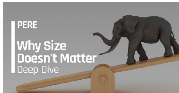
20 October Do you really have to invest in tier 1 firms?