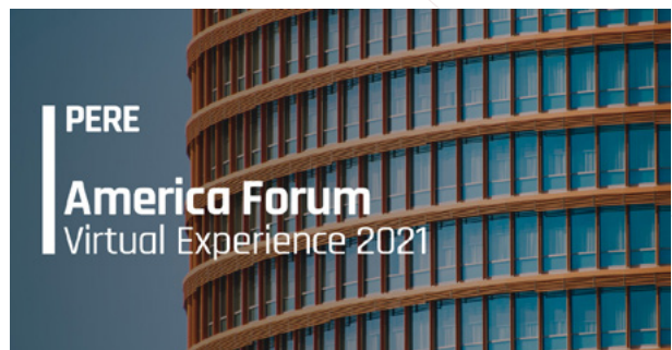
7-8 December North America's most powerful insight and networking

Let our dedicated team show you how membership can enhance your fundraising, investment strategies, and client acquisition.