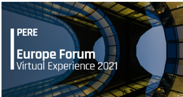
21-22 September Europe's largest gathering of private real estate leaders