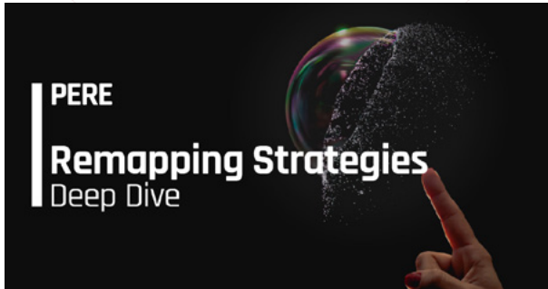
30 June Core real estate - where do you draw the line?