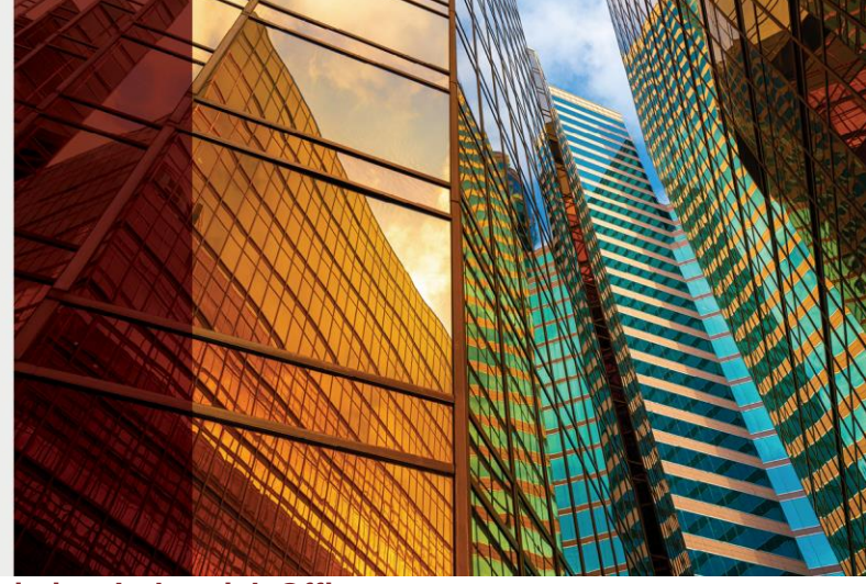
Session 4 Panel: Strong performers: Logistics, Industrial, Office NY 02:00AM | LDN 07:00AM | HK/SG 14:00PM | SYD 16:00PM

Where would you put your last investment dollar – logistics in Japan? Office in Melbourne? Distribution in China? Quick fire, interactive panel on investments and return expectations across the region, and your opportunity to place your bet for 2021-22. Join the Europe and America panels later in the programme and gain a truly global view across sectors.