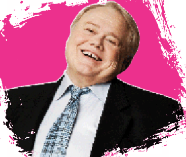
Comedian Louie Anderson