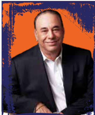
John Taffer CELEBRITY CHEF FROM BAR RESCUE