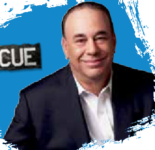
Keynote Speaker Jon Taffer