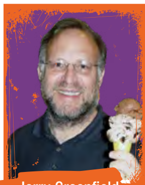
Jerry Greenfield CO-FOUNDER OF BEN & JERRY'S