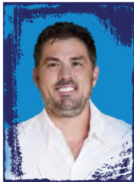
Marcus Luttrell NAVY SEAL, LONE SURVIVOR