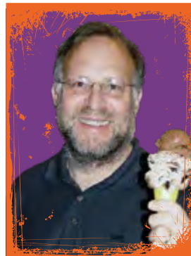
Jerry Greenfield CO-FOUNDER OF BEN & JERRY'S