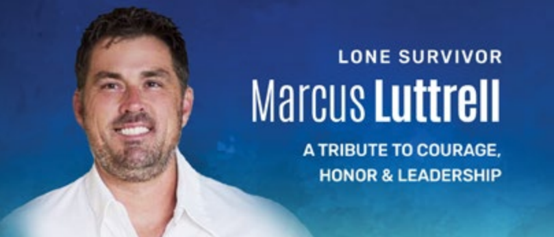
LONE SURVIVOR Marcus Luttrell A TRIBUTE TO COURAGE, HONOR & LEADERSHIP