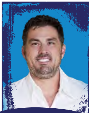
Marcus Luttrell NAVY SEAL, LONE SURVIVOR