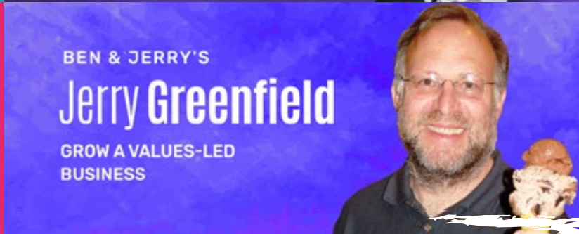
BEN & JERRY'S Jerry Greenfield GROW A VALUES-LED BUSINESS