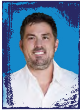
Marcus Luttrell NAVY SEAL, LONE SURVIVOR