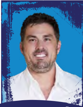
Marcus Luttrell NAVY SEAL, LONE SURVIVOR