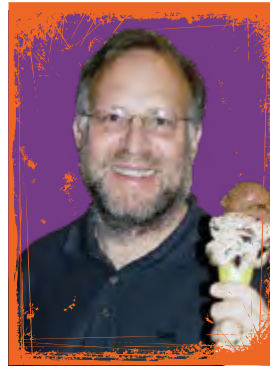
Jerry Greenfield CO-FOUNDER OF BEN & JERRY'S