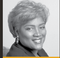
Keynote Donna Brazile Veteran Democratic Political Strategist; Adjunct Professor; Author; and Syndicated Columnist