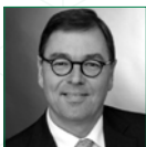
Helmut Von Glasenapp