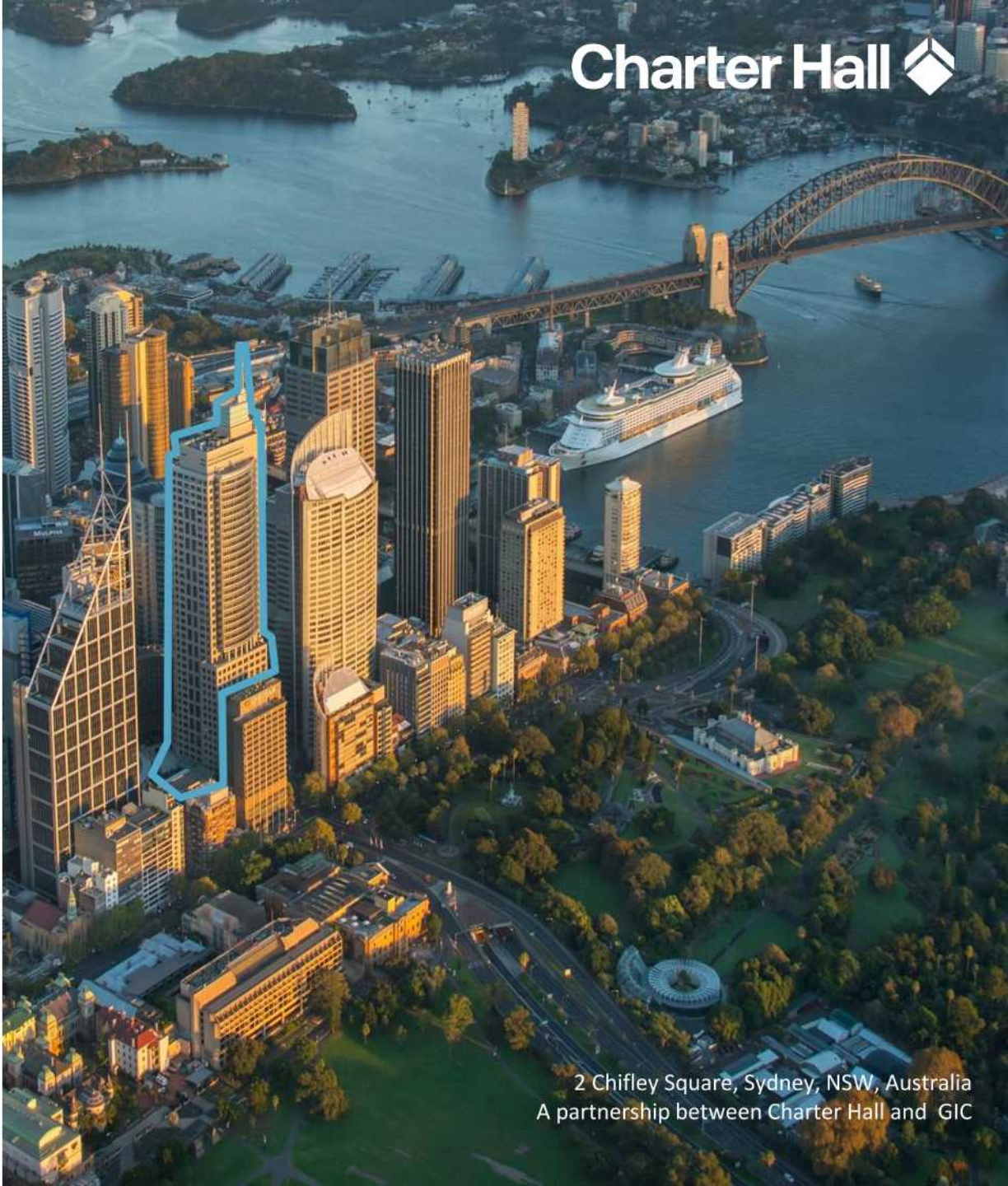
2 Chifley Square, Sydney, NSW, Australia A partnership between Charter Hall and GIC